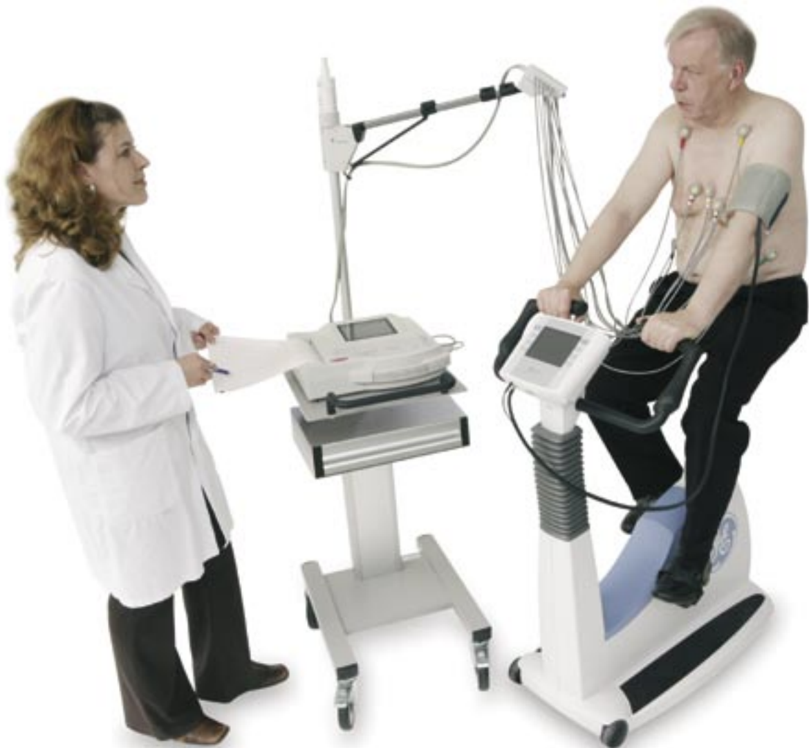
MAC 1200 ST with the electrode application system KISS and eBike comfort PC plus